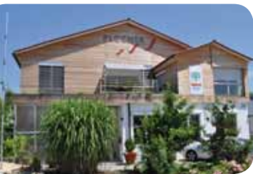
PLOCHER main office in Meersburg

Based on recognition of the fact that it is not the actual substances which produce the effects but rather their energetic information, in 1980 Roland Plocher developed a naturally compatible, resource-saving, physical method of transferring non-magnetic information to enable the purposeful, catalytic activation of biological processes. Products produced in such a way are therefore exceptionally efficient and eco-friendly . The results are reproducible and can be verified using conventional measuring methods.